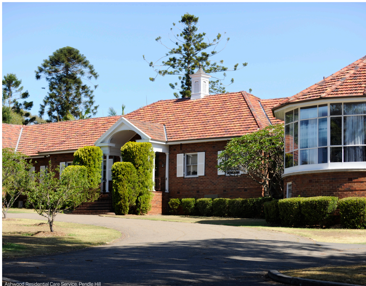
Ashwood Residential Care Service, Pendle Hill

A list of items and services included and for which fees may apply is contained in the Quality of Care Principles 2014.