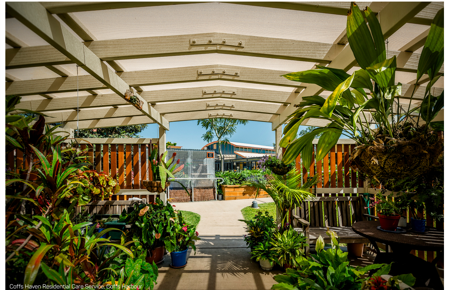
Coffs Haven Residential Care Service, Coffs Harbour