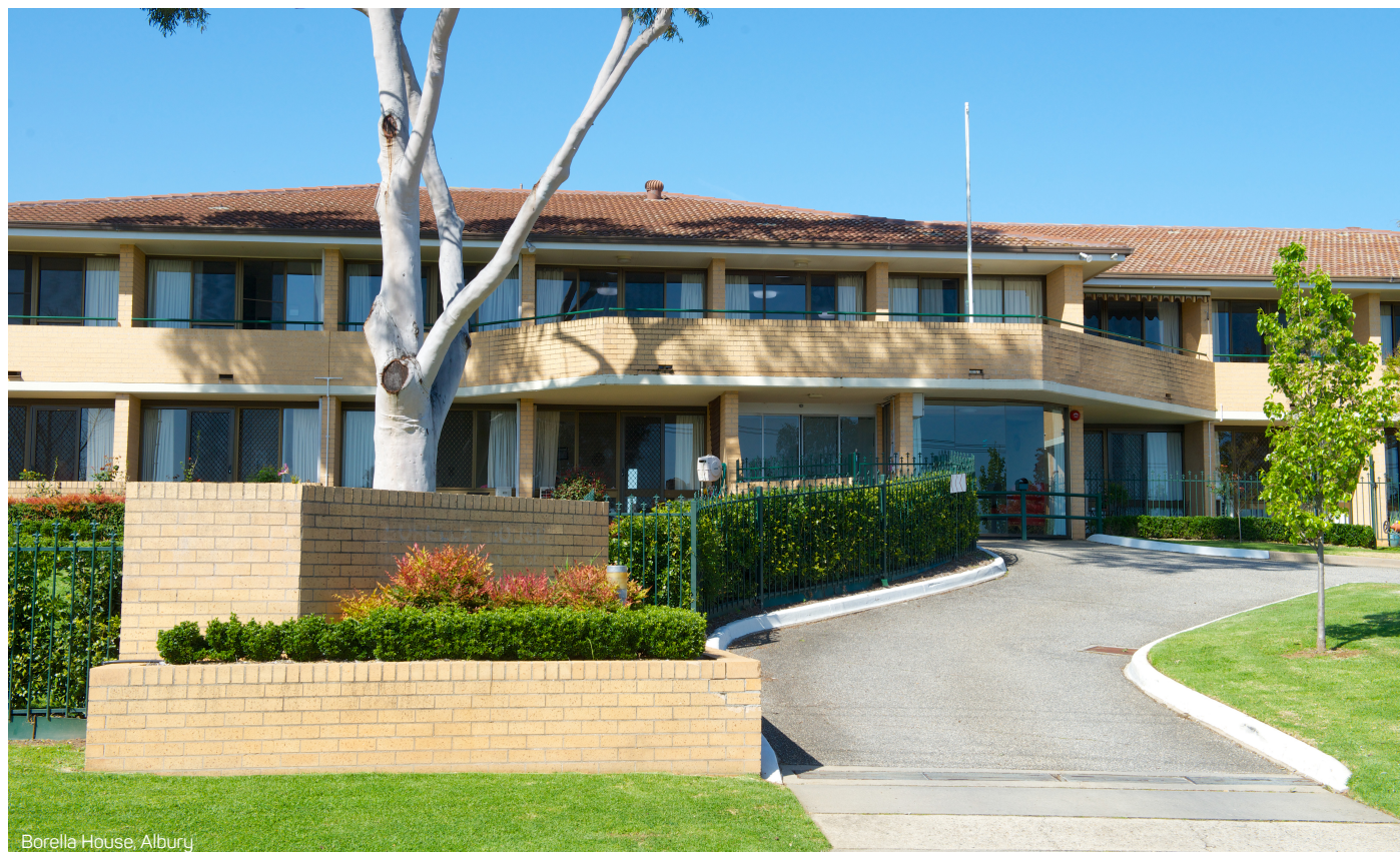
Borella House, Albury

Your payment method will be confirmed before you move into your residence, but you can change your method of payment up to 28 days after this.