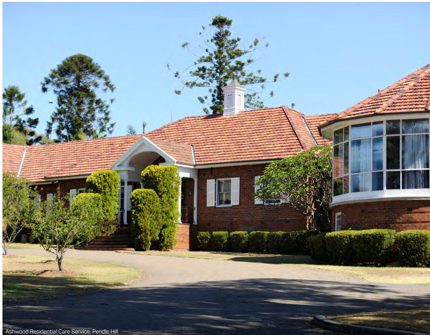
Ashwood Residential Care Service, Pendle Hill

A list of items and services included and for which fees may apply is contained in the Quality of Care Principles 2014.